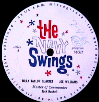
The Navy Swings Program49GH/50GH