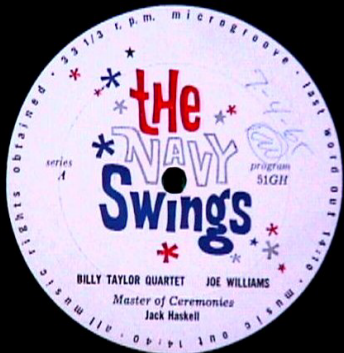
The Navy Swings Program51GH/52GH