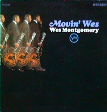
Movin' Wes Verve V6-8610